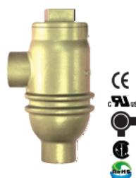
3/4" NPT Ports

LS-159000 Series – Low Cost, Compact Aluminum Housing